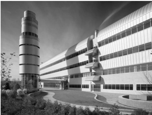
Institute for Scientific Research Fairmont, WV