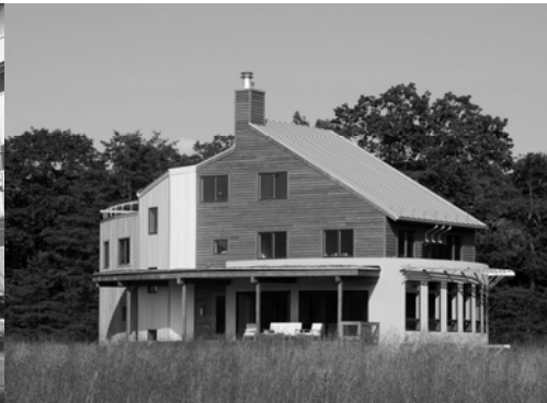
Grove & Dall'Olio Residence Gerrardstown, WV